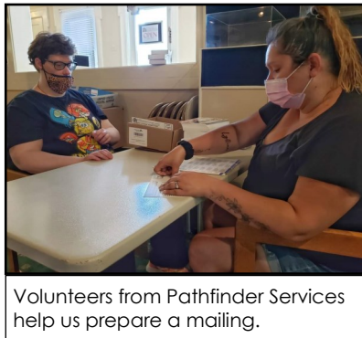
Volunteers from Pathfinder Services help us prepare a mailing.

If you would like to help or are interested to learn more, please contact the Center.