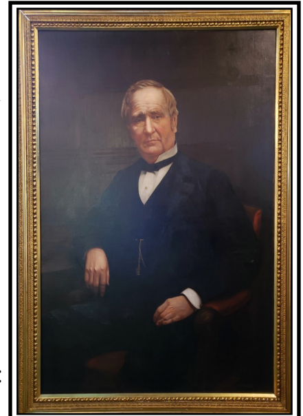
Portrait of Vice President Thomas Andrews Hendricks painted by renowned Hoosier artist, T.C. Steele c.a. 1900-1904. The impressive portrait in frame is nearly four and a half feet tall! Hendricks served in the Indiana General Assembly, the House of Representatives, the Senate and Governor of Indiana. He was elected vice president in 1885 with Grover Cleveland, but died only months into his term.

Hanover has loaned the Center two large portraits of the school's most famous alumni: Indiana vice presidents Thomas Andrew Hendricks and Michael Pence.