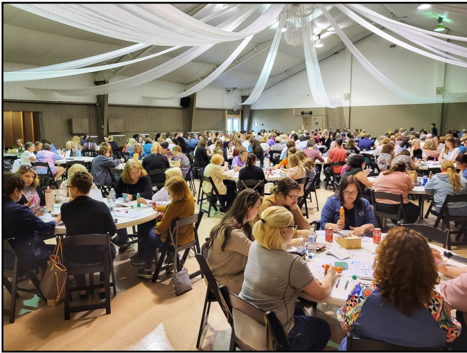
A record crowd awaits the next drawn number at the Fall Designer Purse Bingo Fundraiser held in November.